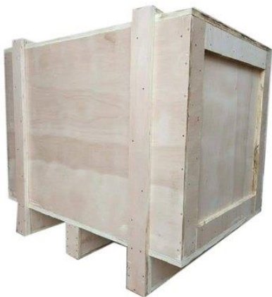
Export Plywood Packaging Box

Our range of products include Industrial Plywood Wooden Box, Export Plywood Packaging Box, Rectangular Plywood Packaging Box and Industrial Heavy Duty Plywood Box.