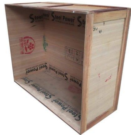
Rectangular Plywood Packaging Box